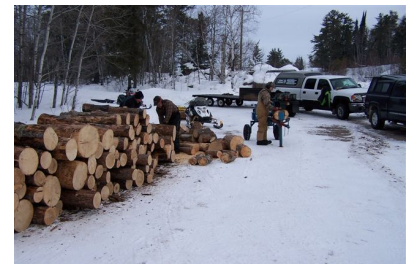
Wood cutting detail at Beauchemin Shelter Feb/09