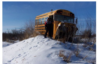
Carol's Shelter. An interesting warmup shelter near Warroad, MN.